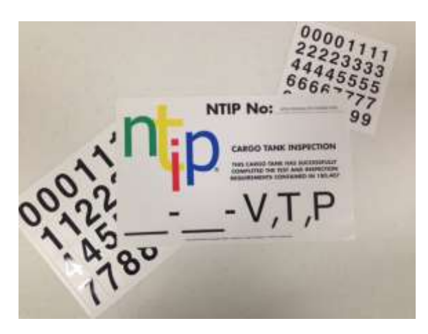
NTIP Re-inspection marking – Replaces Initial Markings (In Compliance)